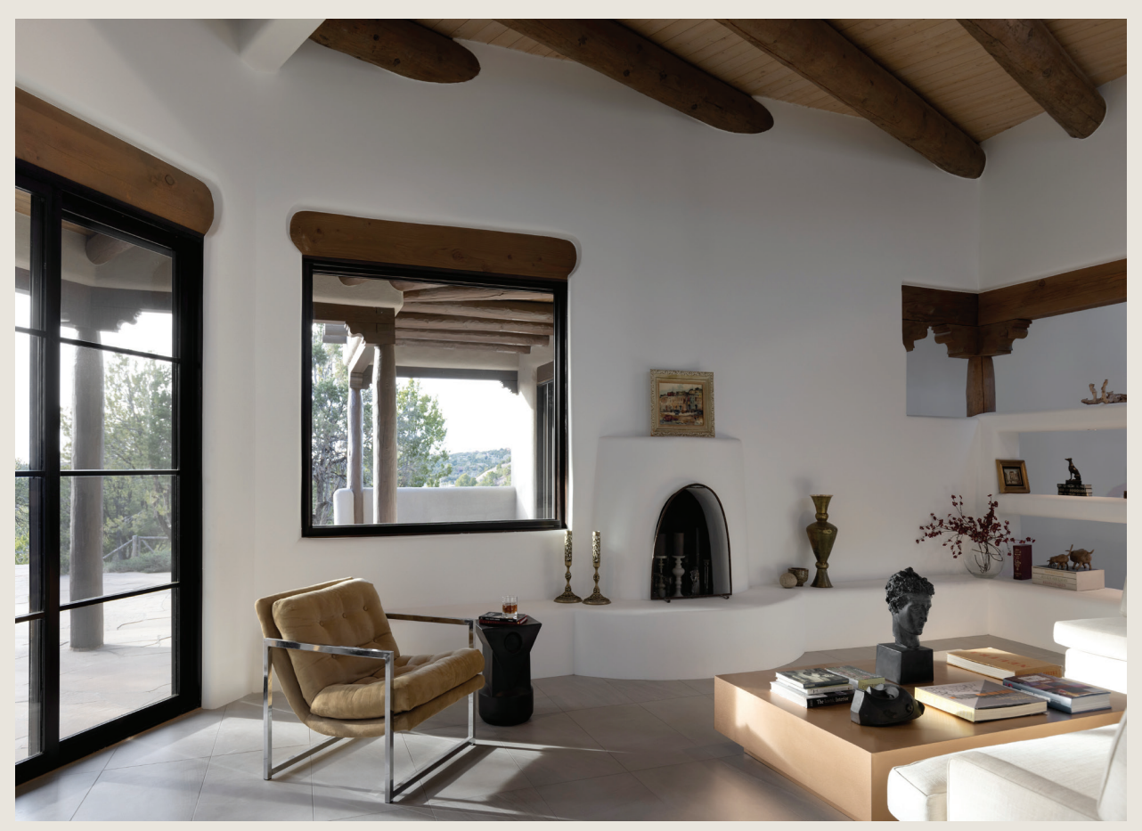
Project: Pueblo-Style Remodel / Builder: Tierra de Zia Contracting, LLC / Designer: Jules Moore Products: Ultimate

The high cost of housing coupled with surging interest rates and limited inventory is effectively shutting millions of Americans out of the home-buying market, resulting in a nationwide standstill in sales.