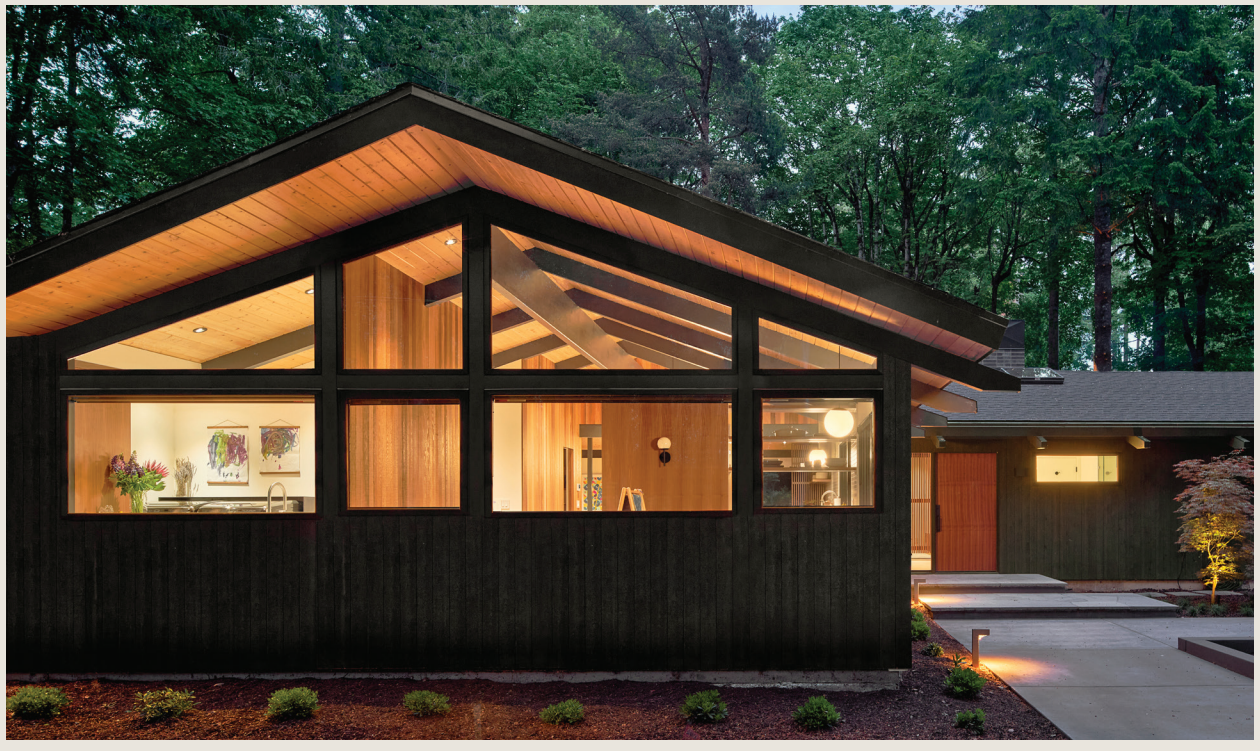
Project: Glen Road / Architect: Risa Boyer Architecture / Photographer: Jeremy Bittermann / JBSA Product: Ultimate

Homeowners are signaling growing interest in technological advancements, a focus on cultivating emotional well-being through thoughtful design, and practical modifications to facilitate aging in place. These considerations reflect a growing recognition of the intricate balance between the physical and emotional needs of homeowners within their living spaces.