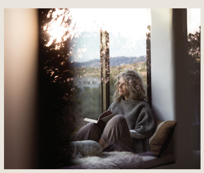
Project: Pueblo-Style Remodel / Builder: Tierra de Zia Contracting, LLC Designer: Jules Moore / Product: Ultimate