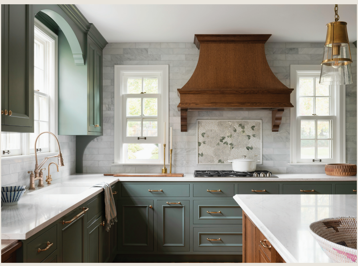
Project: Remodel on the River / Design & Build Team: Vujovich Design Build Products: Ultimate

As time goes on, remodeling priorities and projects undergo constant changes influenced by design innovations and evolving behaviors in how we live and experience our homes.