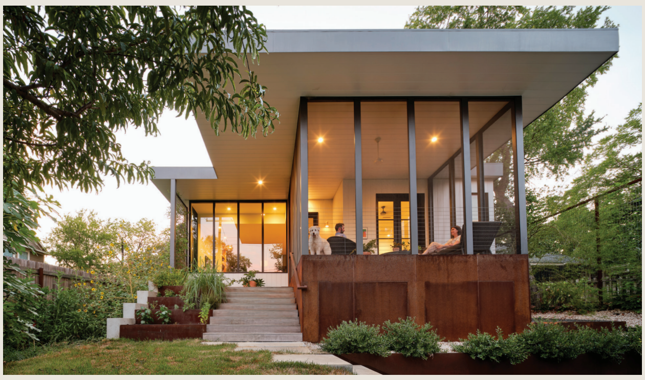
Project: Passive Home / Architect: Hugh Jefferson Randolph Architects Products: Ultimate, Modern, Elevate

Striking a balance between real human emotion and the artificial face of the Internet of Things will be crucial for both consumers and brands, as will knowing when the benefits of tech and automation are worth applying and when humanity should take the lead.