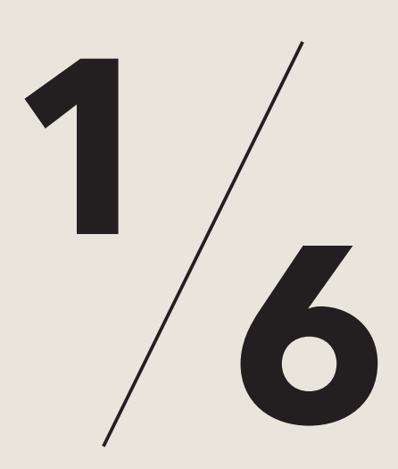
U.S. population aged 60 or older by 2030

The concept of aging in place is well-established, but its relevance is underscored in the aftermath of the COVID-19 pandemic, which highlighted the vulnerabilities of nursing homes and senior living facilities, prompting a reassessment of long-term living options. Adding to this challenge is the rapidly aging U.S. population. According to the World Health Organization (WHO), approximately 1 in 6 people will be aged 60 or older by 2030. Many older homes are ill-equipped for aging in place, often necessitating substantial modifications for safe and comfortable living for older homeowners. Research consistently highlights homeowners' desires to age in place and the improved health outcomes with doing so, emphasizing that living in spaces promoting mobility and preserving social lives can have significant positive mental health outcomes.