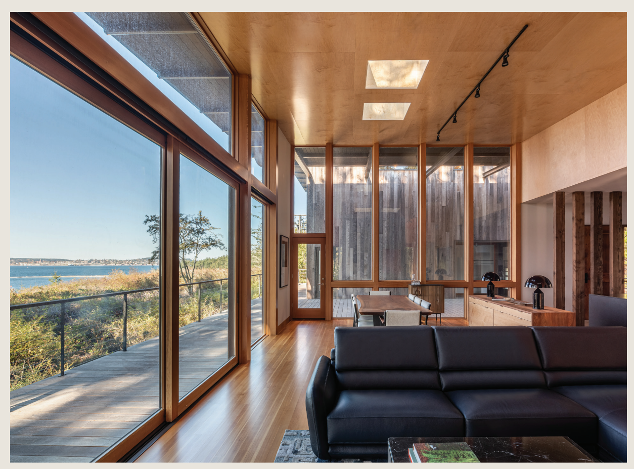
Project: Marrowstone Island / Architect: Dan Shipley, Shipley Architects Products: Ultimate

Despite these conditions, Redfin reports a sustained and substantial interest in cities like Phoenix, Las Vegas, and Miami, driven by more affordable housing options. Homeowners in these areas are likely to explore renovations aimed at reinforcing their homes against extreme weather phenomena such as high winds, heavy precipitation, and rising temperatures. As coastal areas take the brunt of more severe climate changes, homeowners are expected to gravitate toward custom building products and reinforcements that can withstand the extreme conditions. Recent research from Zillow found that more than 4 in 5 buyers will factor climate risks into their home buying decisions, with millennials and Gen Z most likely to consider climate as compared to older generations. The paradox of maintaining interest in high-risk areas raises important questions about the future of housing choices and renovation in the face of climate change.